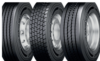
From Ekeri you'll always get high quality tires.