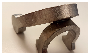
Additional lashing rings tested to a breaking force of 4t and 2t.