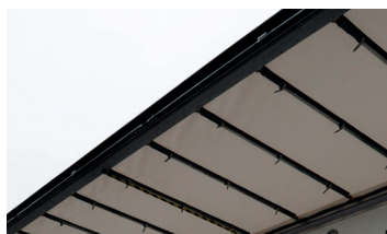
Insulated tarpaulin roof is also available.